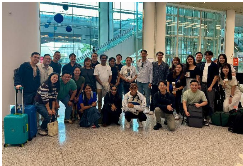
Ding Yi Music Company, Siong Leng Musical Association and other arts groups ready to travel to Gwangju

Singapore, 3 October 2025 – To celebrate the 50th anniversary of diplomatic relations between Singapore and South Korea, Ding Yi Music Company and Siong Leng Musical Association have been specially invited by the Asia Culture Center's Beyond Borders: Asia's New Wave festival to jointly present New Singapura: Echoes of Diversity on 4 October at the Asia Culture Center Theater in Gwangju. This concert will serve as a cultural bridge, showcasing the unique artistic charm of Singapore where tradition and modernity harmoniously converge.